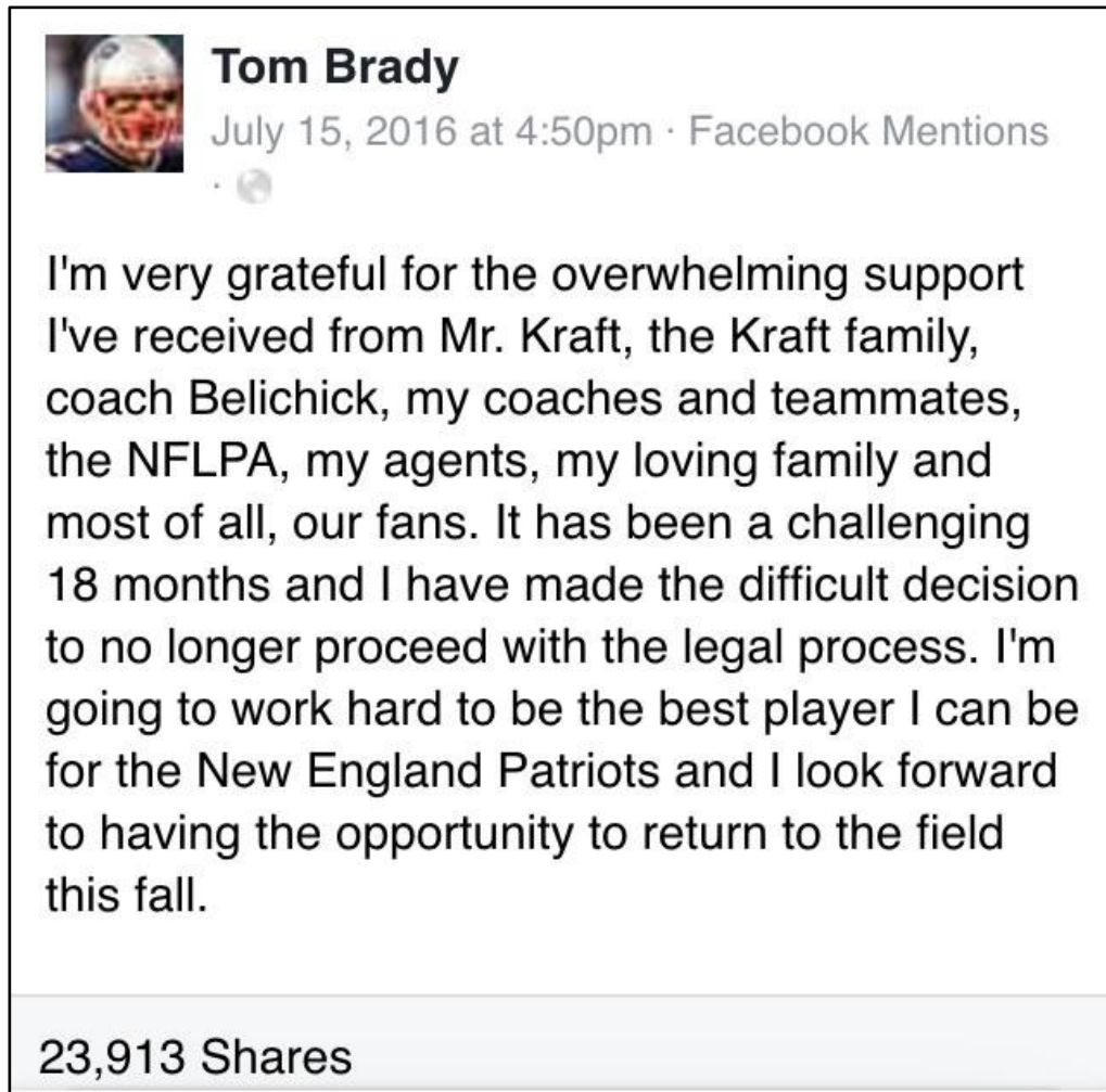
Figure 2. July 15, 2016, Facebook post by Tom Brady expressing gratitude for the support he received in the process and his decision not to proceed with the legal process.

Brady's image does not appear to have been tarnished at all by Deflategate. In fact, as the cartoons illustrate, the Golden Boy reasserted his status as the villain label was shifted, yet again, to Goodell. Before the controversy, Brady was already destined for the Pro Football Hall of Fame as one of the greatest quarterbacks to ever play the game. There will